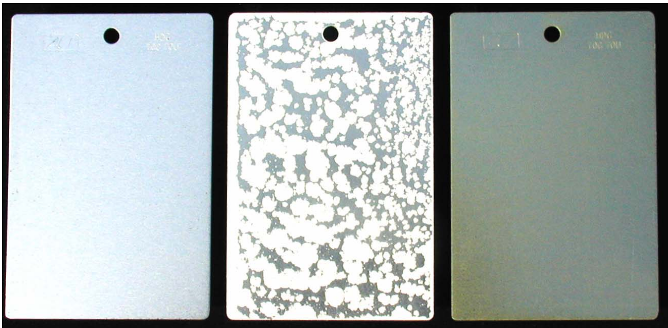
New Galvanized Steel